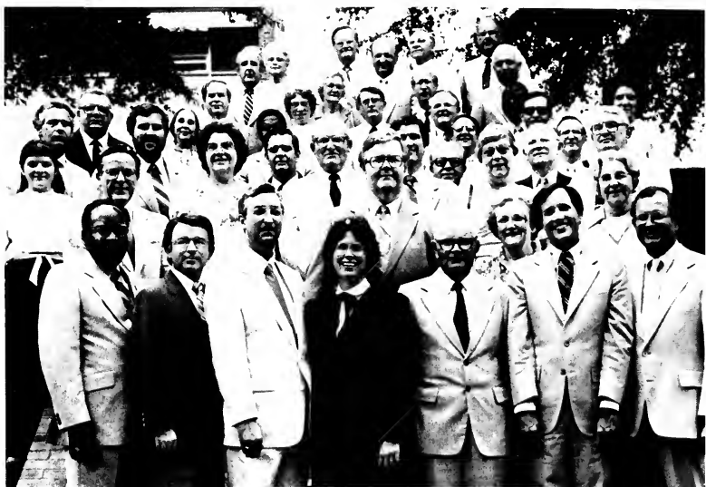
Delegates To Jurisdictional Conference